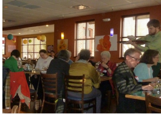
PARTICIPANTS ENJOYING THEMSELVES